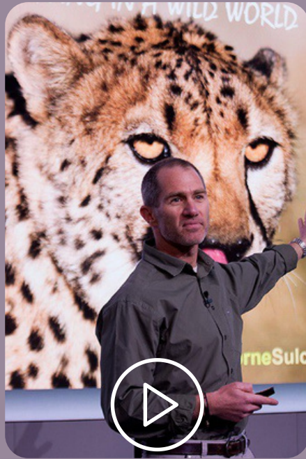
15 Minute Excerpt Link