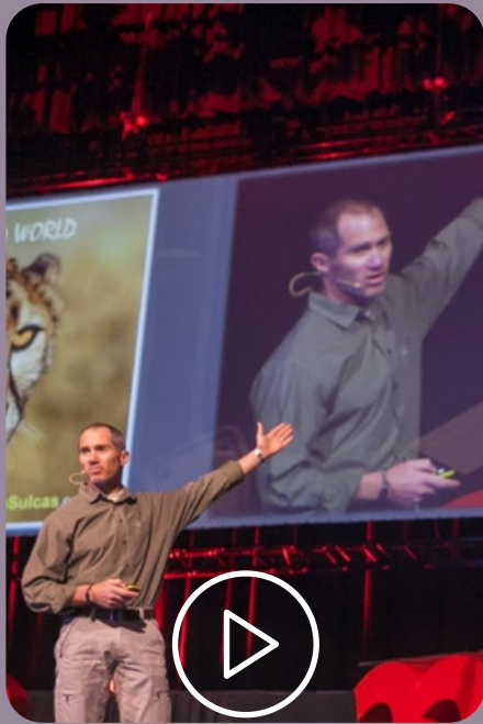
Sizzle Reel Link